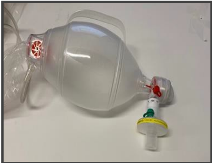
Inter-surgical filter application with the Bag

Limited number of pediatric HMEF available. More on order. Dead space on peds size is 37ml, infant size is 15 ml.